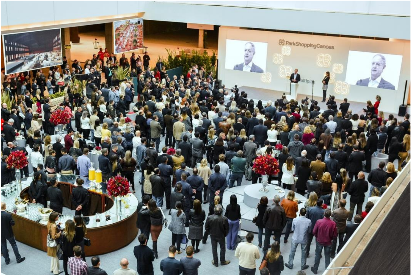
ParkShopping Canoas, Canoas, State of Rio Grande do Sul